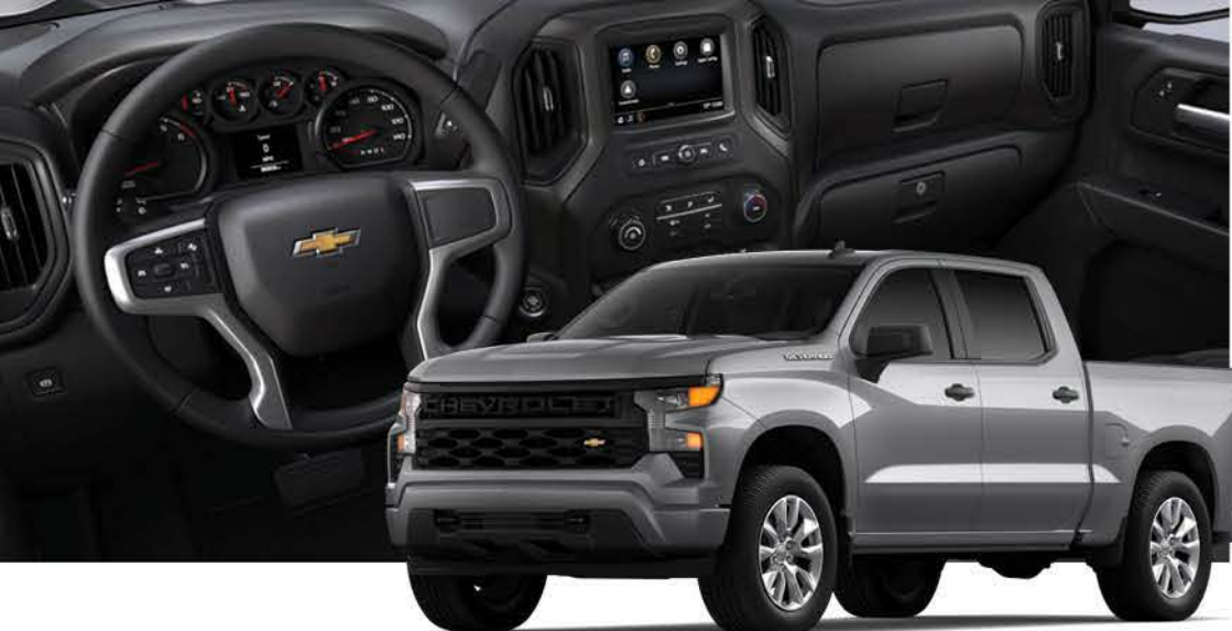
2023 Chevrolet Silverado 1500 Work Truck shown.