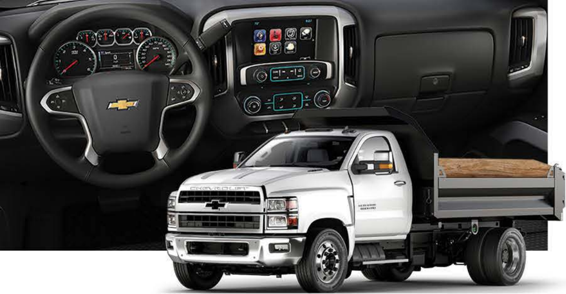
2023 Chevrolet Silverado 6500 HD Chassis Cab shown. Vehicle shown with upfits from an independent supplier and are not covered by the GM New Vehicle Limited Warranty. GM is not responsible for the safety and quality of independent supplier alterations.